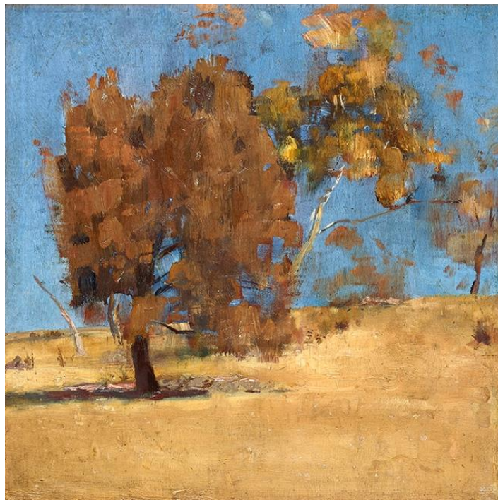
TOM ROBERTS 1856-1931 She-Oak and Sunlight (1889) oil on wood, 30.5 x 30 cm Estimate $220,000–280,000

Masterpiece by John Russell Presented to the Public for the First Time in Almost 50 Years