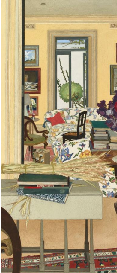
CRESSIDA CAMPBELL born 1960 Interior with Wheat (1996) watercolour on incised woodblock, 115 x 50 cm Estimate $70,000–90,000 Sold for $256,200 9 April 2019

Melbourne | +61 (0)3 9508 9900 | Thomas Austin | Thomas.Austin@smithandsinger.com.au