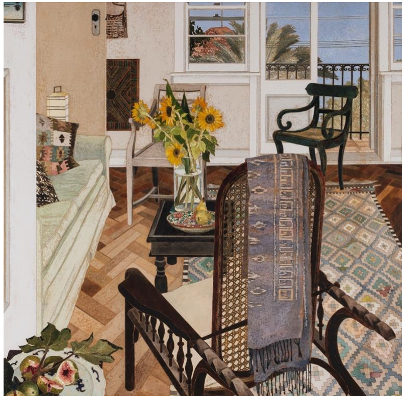
CRESSIDA CAMPBELL born 1960 Interior with Sunflowers and Figs (1998) watercolour on incised woodblock, 100 x 100 cm Estimate $80,000–120,000 Sold for $201,300 9 April 2019

© Cressida Campbell/Copyright Agency, 2020