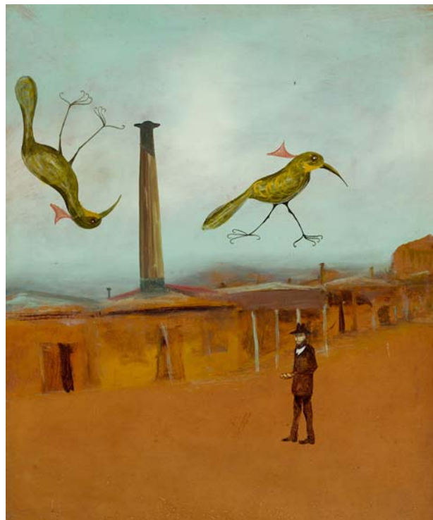
SIDNEY NOLAN 1917-1992, Feeding the Birds 1948. Private Collection, courtesy of Sotheby's Australia