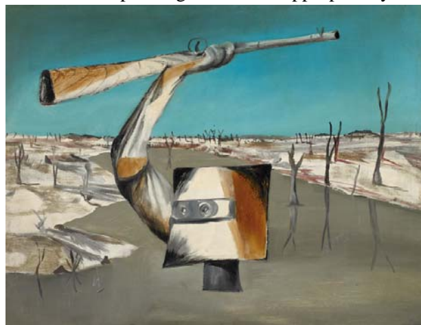
SIDNEY NOLAN 1917-1992, Ned Kelly: Crossing the River 1955. Private Collection, courtesy of Sotheby's Australia