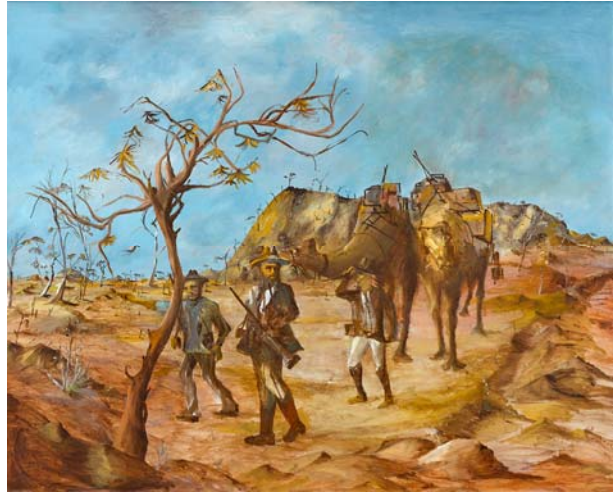
SIDNEY NOLAN 1917-1992, Approaching Cooper's Creek 1950. Private Collection, courtesy of Sotheby's Australia

Exhibition dates: 27 March – 9 April, 10am – 5pm