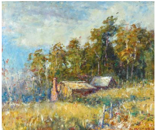
FREDERICK MCCUBBIN 1855-1917, Cottage at Mount Macedon (1913). Estimate $180,000-220,000