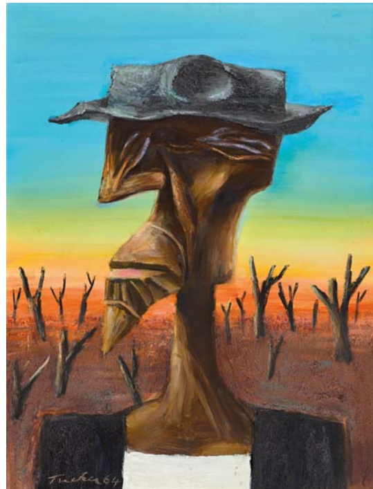
ALBERT TUCKER 1914-1999 Explorer 1964. Estimate $150,000-200,000