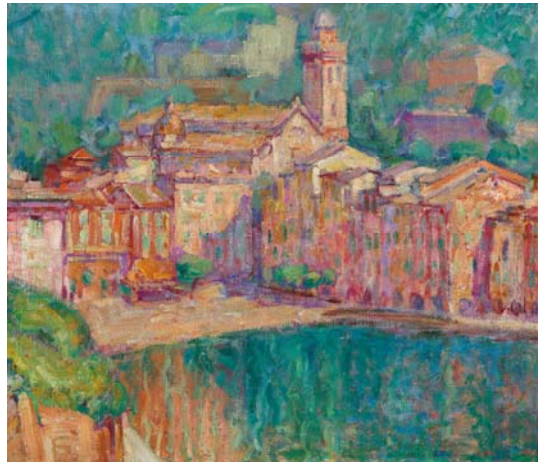
JOHN RUSSELL 1859-1930, Portofino (1920). Estimate $150,000-200,000

Copyright in the image(s) supplied shall remain vested in Sotheby's Australia. Please note that image(s) may depict subject matter which is itself protected by separate copyright. Sotheby's Australia makes no representations as to whether the underlying subject matter is subject to its own copyright, or as to who might hold such copyright. It is the borrower's responsibility to obtain any relevant permissions from the holder(s) of any applicable copyright and Sotheby's Australia supplies the image(s) expressly subject to this responsibility. Note that the image(s) provided is/are for a one-time use only and no permission is granted to alter the image(s) in any way.