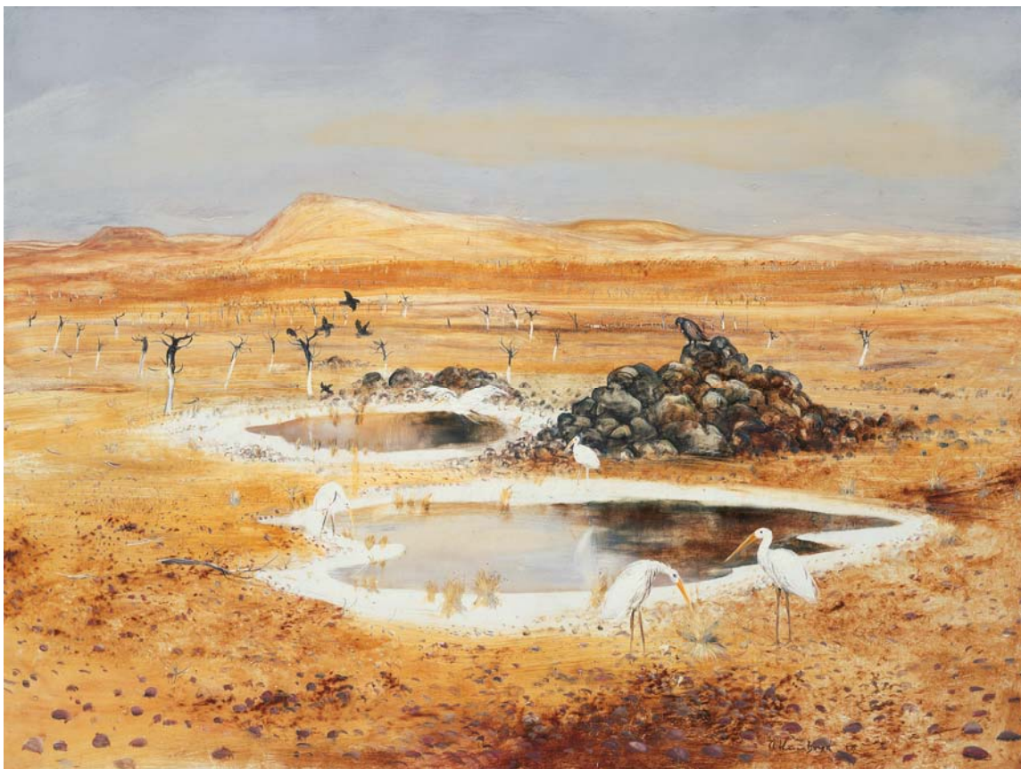
Arthur Boyd 1920-1999, Landscape with Waterhole and Herons, near Alice Springs 1954 . Estimate $400,000-600,000

One of the finest private collections of Australian Art to be auctioned in recent years, the sale includes major works by Australia's most significant Impressionist and Modern artists.