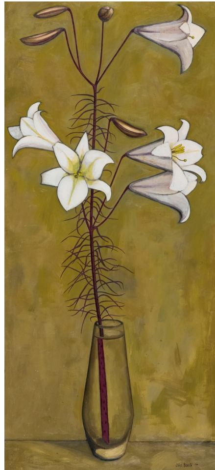
John Brack 1920-1999, Christmas Lillies 1955. Estimate $200,000-300,000.