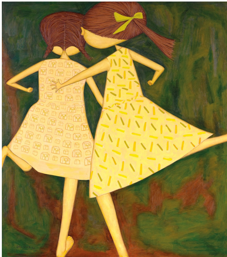
John Brack 1920-1999, Two Running Girls 1959. Estimate $1,000,000-1,200,000