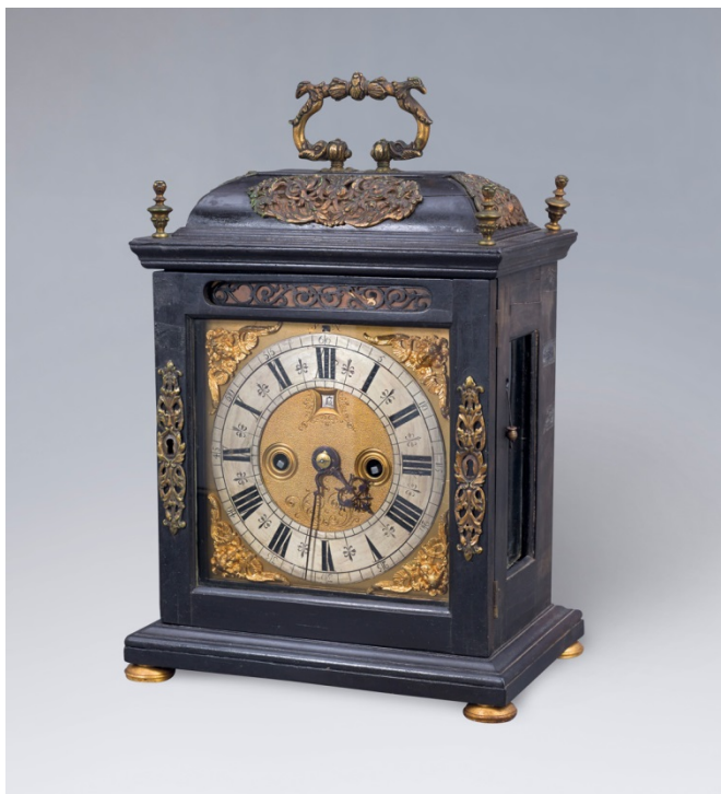
A fine and rare ebony veneered striking bracket clock with pull quarter repeat, Henry Jones, London, circa 1685. Estimate $35,000-45,000

Museum. Henry Jones was a celebrated maker of quality clocks and watches in London (estimate $35,000-45,000, lot 259, pictured). The auction also includes fine examples of longcase, carriage and mantle clocks.