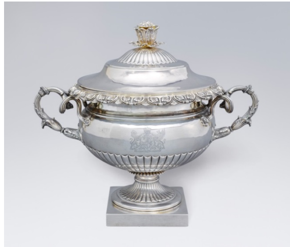
A fine sterling silver soup tureen and cover, Paul Storr, London, 1820. Estimate $20,000-30,000

Le Pho (1907-2001) a Vietnamese painter, was awarded a scholarship and trained at the École des Beaux-Arts in Paris. He painted sceneries of Vietnam, still life with flowers, family settings and portraits. Vietnamese women, most often portrayed as elongated figures evoking the influence of impressionism and surrealism, were a recurrent theme in his work. ( Devant la Fenetre ) featuring a woman seated in a contemplative posture at a table with child looking up at her is a fine example of Le Pho's work (estimate $20,000-30,000, lot 94, pictured).