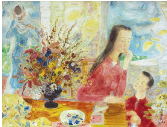
LE PHO 1907-2001, ( Devant La Fenetre ). Estimate $20,000-30,000