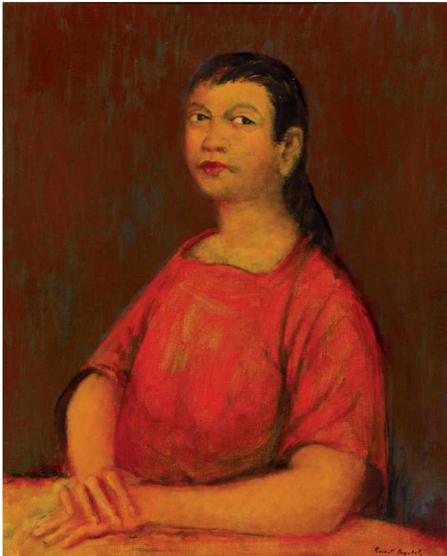
Russell Drysdale 1912-1981, The Barmaid, Broome 1965. Estimate $400,000-600,000

An exceptional selection of Important Australian & International Art from colonial through to contemporary will be offered for sale by Sotheby's Australia on 26 August 2014 in Sydney. The sale features 95 lots with a combined pre-sale estimate of $5.5 million to $7.4 million. Re-affirming strength in the market and vendor confidence in selling with Sotheby's Australia, many rare and significant works have appeared for auction for the first time in decades, with important examples repatriated from overseas.