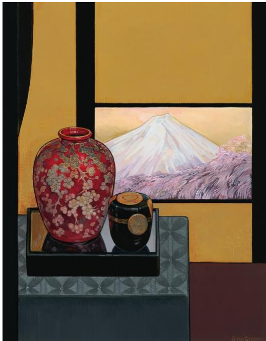
Criss Canning born 1947 The View from Oshino 2020 oil on board, 50 x 40 cm SOLD

Canning's works are held in the permanent collections of the National Gallery of Australia, Canberra; Art Gallery of New South Wales, Sydney; Art Gallery of Ballarat, Ballarat; Castlemaine Art Museum, Castlemaine; Cairns Art Gallery, Cairns; Artbank, Melbourne; and private collections in Australia, Canada, France, Hong Kong, Singapore, United Kingdom, and the United States of America.