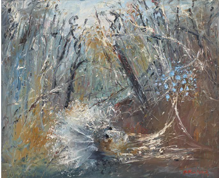
ARTHUR BOYD 1920-1999 Bride with Blue Flowers (1969) oil on canvas, 51 x 63 cm Estimate $30,000–50,000